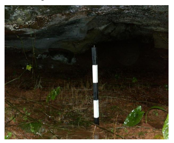
Plate 4. Umude Nworji Rock-Shelter

This rock shelter is located in Eziama village in Mmaku. According to oral tradition, this rock-shelter houses a big python that is harmless to the indigenes of Mmaku. The Umude Nworji rock-shelter is situated at 240<sup>o</sup>C Northwest with a height measurement of 2.14 m and width of 2.55m