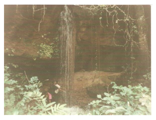
Plate 6. Opia Echeta Rock-Shelter

This rock-shelter has a water fall. It is located in Ezioha village in Mmaku. It is situated at 85^{\circ} C Southeast of the community. The measurement of this rock-shelter was not taken because of the pool of water that surrounds it.