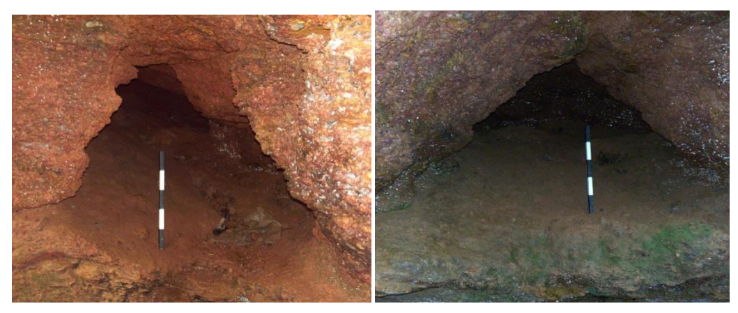
Plate1a. Inyikwe Cave (First Cavity)

The cave has two cavities. Measurements were taken from the base to the roof; thus, the first cavity has a height of 1.15m and a width of 1.48m; while the second cavity measured 1.1m and 2.38m for height and width respectively ( Plate 1a and 1b ).