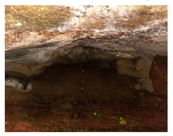
Plate 5. Ngala Agu Rock-Shelter

This rock-shelter is some kilometres away from Umude Nworji rock-shelter and it is situated at 320<sup>o</sup>C Northwest. The height and width are measured 1.60m and 3.85m respectively.