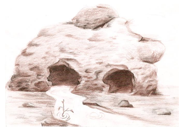
Plate 3. A Sketch Diagram of Achiyi cave

This cave had no myth. It is connected to Isiogba cave. It has two cavities. We were not allowed to take picture of the cave because according to our informants, the deity inhabiting the cave abhors light reflection. However, we were able to sketch the cave. Achiyi cave is situated at 280^{\circ} C Northwest of Achi community. Only one of the openings was measured from the base to the top as thus: height 1.48m and width 1.70m