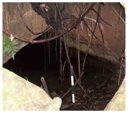
Plate 2. Ogba Agu-Ukwu (the smaller cave)

and animals in the past. The Ogba Agu-Ukwu is facing north; while the smaller one opens at 340^{\circ} C Northwest. The measurements of these caves were taken from the base to the top. The height and width of Ogba Agu-Ukwu measured 2.8m and 4.95m respectively; while the smaller cave measured 0.97m in height and 2.53m in width.