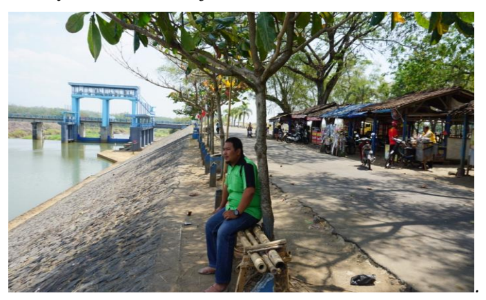
Figure1. DAM COLO location at Nguter Sukoharjo

DAM COLO or commonly called DAM COLO Nguter District Sukoharjo District to be a tourist asset because it has the scenery and an interesting location. The embryo of the location becomes a tourist spot because of the frequent local people take advantage of several points on location twrsebut for short leisure and leisure. That's because in addition to the DAM COLO water gate is an area that is still natural that is very comfortable to be used for rest and refreshing for a moment. So that over time, the habit is transmitted and passed down through the generations by the local community and even spread to the luaa community around Sukoharjo District.