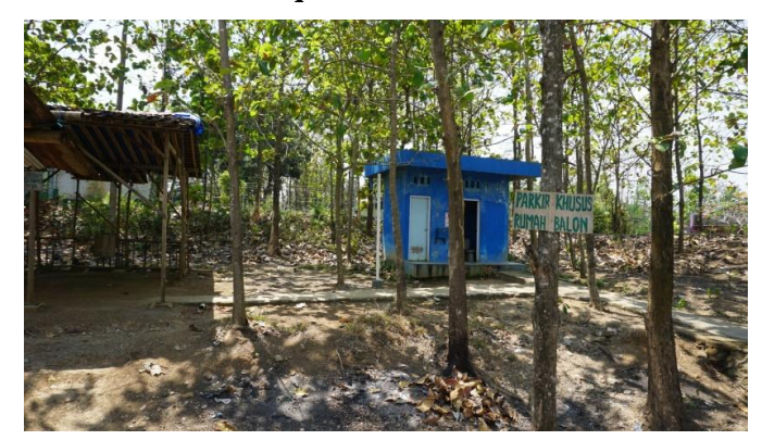
Figure1. The existing condition of toilet facilities

4.1. Improving the Facilities of More Adequate Toilets and Procurement of Small Mosque