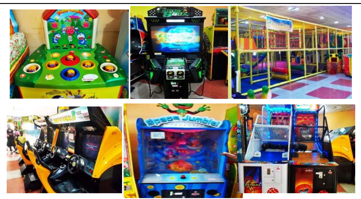
Plate3. The Fun Arcade