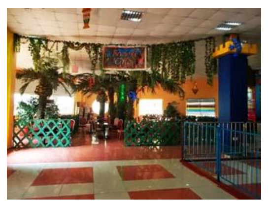
Plate4. The Arcade Restaurant