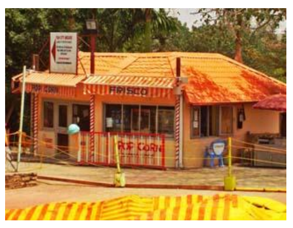
Plate2. Bamba Shop

There are cafeterias and shops all over the place for visitors' satisfaction. The cafes includes the forest café and the Shisha hut, each offering foods with unique and delicious tastes Some of the shops include the wonder shop, Nina candy shop, fountain shop, Bamba shop and many others