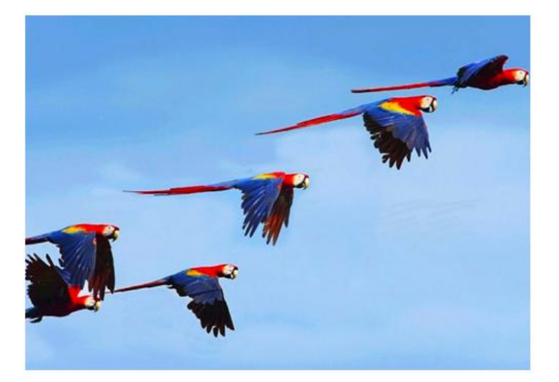
Figure2. Global status of macaws