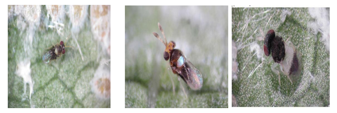
Plate 5. Natural enemies of rugose spiraling whitefly, Encarsia guadeloupae, E. noyesi and Alueroctonus vittatus