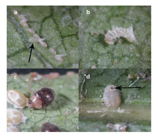
Plate 4. Life stages of Nephaspis oculata. a) A single beetle's egg (arrow) laid adjacent to a row of rugose spiraling whitefly eggs. Rugose spiraling whitefly eggs become darker as they age as can be seen here. The wax on the eggs was removed in order to take this photo. b) Larva feeding on a rugose spiraling whitefly egg. c) An adult male feeding on a 4th instar of rugose spiraling whitefly. d) A hole (arrow) created by the feeding activity of a beetle. The hole looks similar to an exit-hole created by parasitoids (Taravati et al., 2016)

Natural enemies to recorded were RSW viz., Encarsia guadeloupae Viggiani, E. noyesi, Alueroctonus vittatus, Nephaspis oculata. Among these E. guadeloupae potential biocontrol agent against RSW as 50 to 60 % natural parasitization.