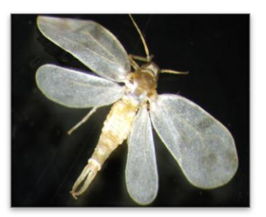
Plate 3. Rugose spiraling whitefly, A. rugioperculatus, a. Male, b. Female