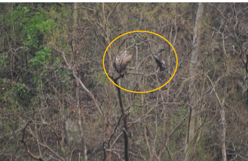
Figure 1. Captured Photos in Study site