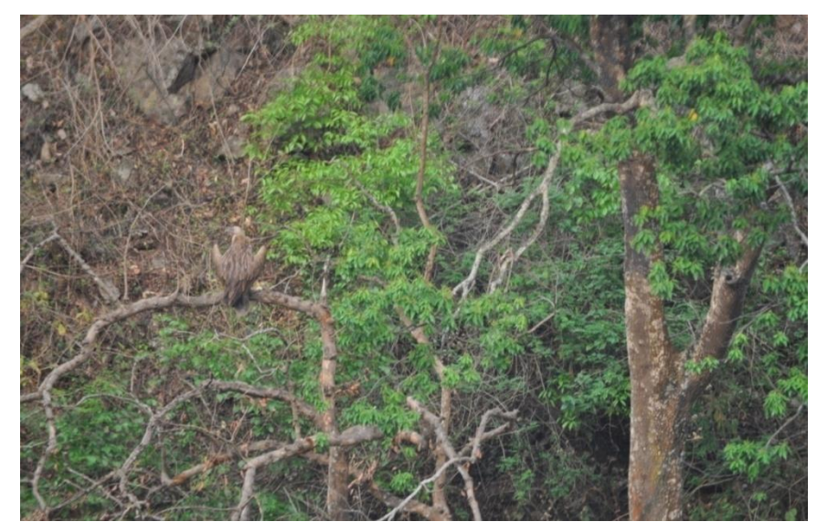
Figure 2. Captured Photos in Study site

The red-headed vultures were found resting mainly on two plant species namely Bombax ceiba and Lagerstroemia parviflora . However, red-headed vulture prefers to rest on the branch of Adina cordifolia , Sapium insigne , Terminalia bellirica , Shorea robusta , Premna integrifolia and Litsea polyantha etc.