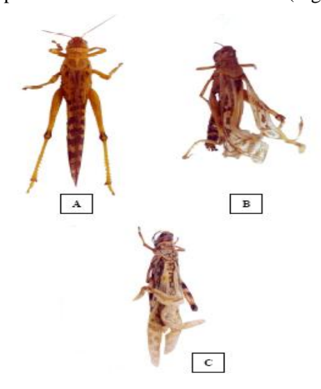
Fig1. Different adult malformations of S. gregaria were produced as a result of the nymphal treatments with N. sativa extracts. A) Normal adult. B) Treated adult with curled legs, incompletely developed short antennae and crumbled wings with transparent posterior area. C) Treated adult with crumbled wings of transparent posterior area and coiled antenna.

Petroleum ether and n-butanol extracts were more potent because different percentages of adult malformations were observed almost proportionally to the concentration (50.0, 14.2,14.2 and 12.5 at 30.0, 15.0, 7.5 and 3.7 % of petroleum ether extract as well as 40.0, 33.3, 33.3 and 25.0 at 15.0, 7.5, 3.7 and 1.8 of n-butanol extract). The adult deformities could be, generally, assorted in the following features: Adults with curled legs and coiled incompletely developed short antennae. Adults with crumpled wings and transparent posterior area and coiled antennae (Fig.1).