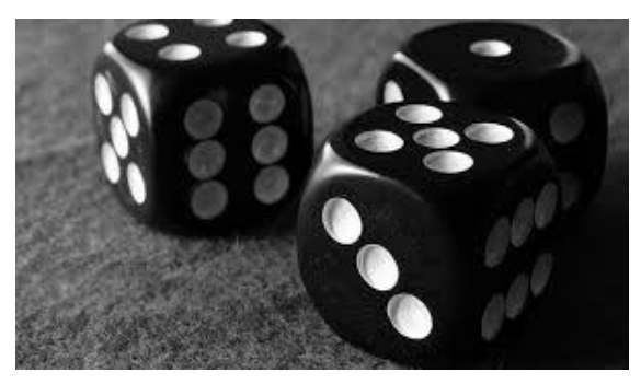
Peak Signal to Noise ratio (PSNR): 49.671