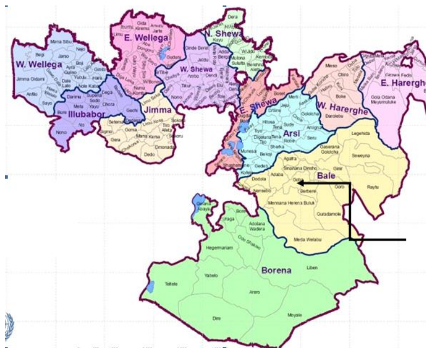
Figure1. Map of administrative region, Zone and Woreda of Oromia including my study site (Goba)

This study was conducted in Oromia Regional State; Bale zone; Goba district which is located 445kms south east of Addis Ababa at altitude of 2400-4377 m.a.s.l. The area was found at the latitude of 5°0'N and 40° 0'E. The area covers 177302 km 2 in range lands. The area is bordered by different district such as, Sinaana by north; Haranna Buluk and Dallo Manna by south; Adaba and Dinsho by west, and Berbare by east. Topographically, it has 84% high land, 11% “weynadega”, land and 5%“wurch”, cold moist temperature, It receives an annual range of rain fall from 1150-1400 mm, and the annual range of temperature from 4-24°C. It receives bimodal rainfall occurring from March to April (a short rainy season) and from July to October (long rainy season). It has a total of 198268 livestock of which 63405 were sheep (GWRAD, 2013).