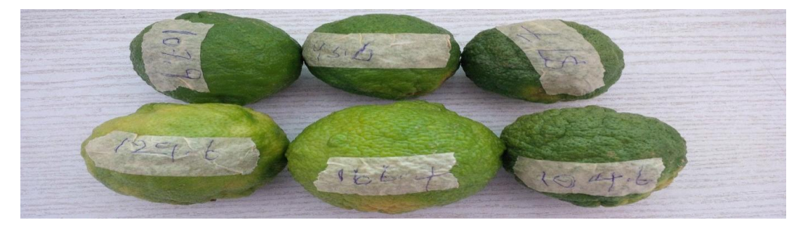
PlateI. Citrus Limon fruit

The plant under study is Citrus limon , belonging to the Rutaceae (Rue Family, Citrus Family). It grows as small thorny trees which reaches a height of 10 to 20 feet and can survive eve in drought but mostly available during the dry season. The part of the plant used was the peel of the fruit Plate I.