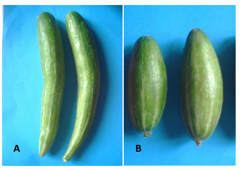
Fig1. Trichosanthes anguina (A) and T. dioica (B) Fresh vegetables

International Journal of Research Studies in Biosciences (IJRSB)