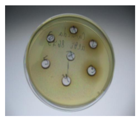
Fig2. Showing Zone of inhibition with BA-1along with tested antibioticChloronitromycinof 24 hours C. albicans 8673

The sensitivities of the test organisms to infusions were indicated by clear zone around the wells (Figure 2).