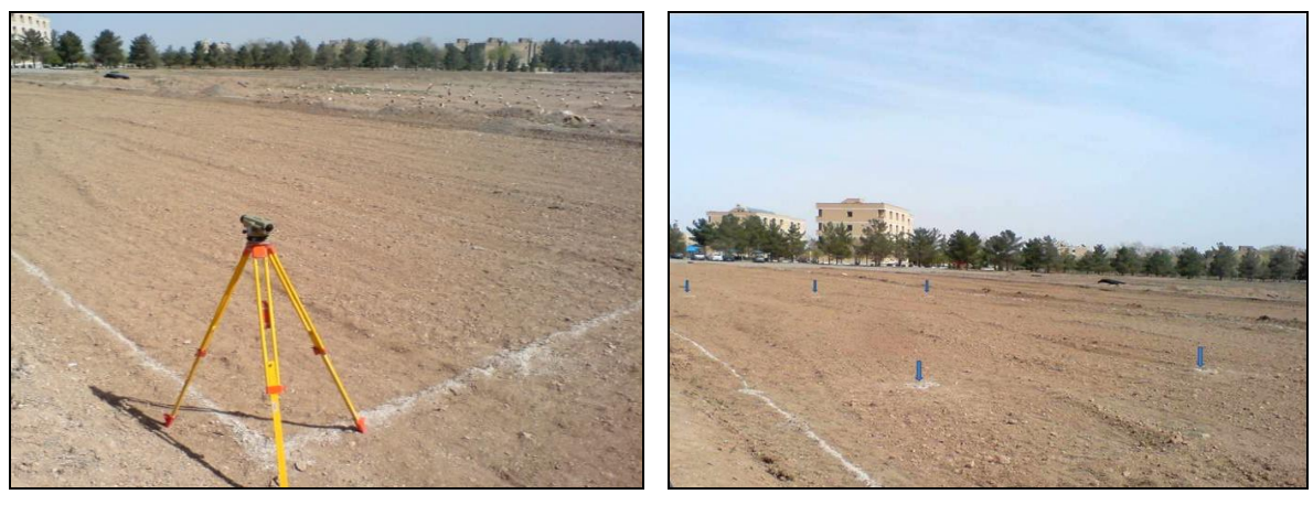
Fig 3. Field boundaries; Field surveying and gridding after initial leveling

In this research a field with the width of 13m and the length of 110m was selected for land leveling. Soil compaction was resolved with plowing and disking and then initial leveling was done by traditional leveler. Field boundaries were marked and a bench mark point was considered to convert readings in surveying to elevation and then field was surveyed and gridded for leveling operation (Fig, 4 and 5).