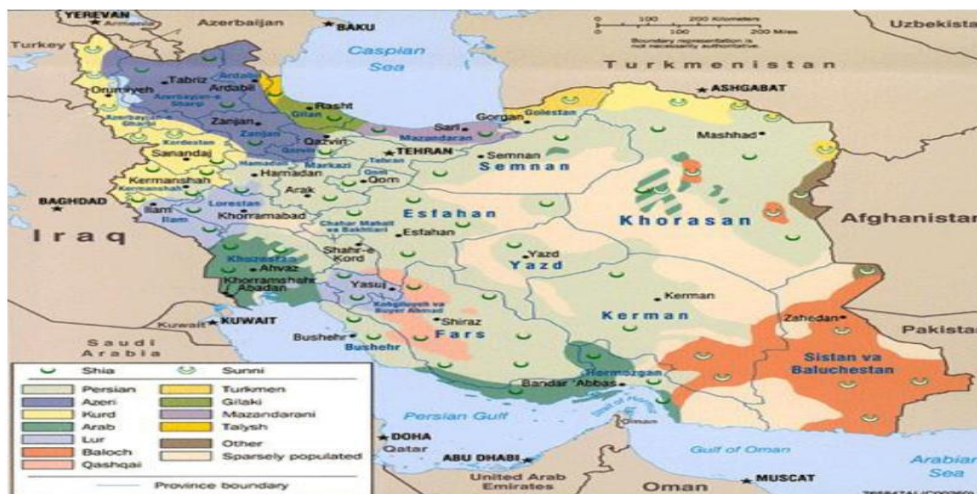
Figure 1. Place of the Sistan Baluchistan province of Iran

The Sistan Baluchistan province of Iran is adjacent to Afghanistan and Pakistan. It is at the Oman Sea too. Figure 1 illustrates the place of the province and its regional importance.