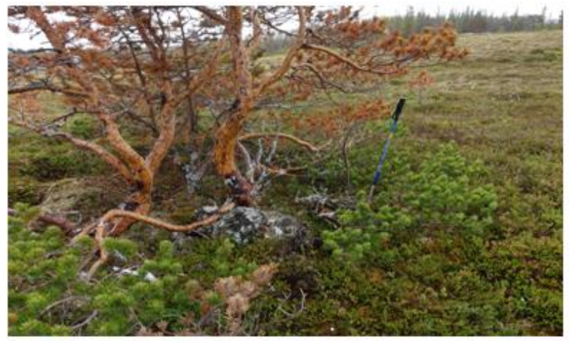
Fig. 22. Detailed view of the basal parts of the stem oldest stem, and a centrifugally spreading edging of layering stems with adventitious rots at a distance of 1-1.5 m. Compared to most of the stems, the oldest part of this clonal pine specimen is disproportionally thick.