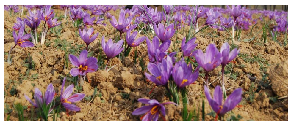
Figure3. Harvesting/Flower plucking time of Saffron in Pampore, Pulwama

Late sowing as well as early sowing of seeds is not recommended in the saffron cultivation. The seeds are generally being sown at the depth of about 8cm to 11cm (4 to 6 inches), however, there is not any strict rule for the planting of seed corms. A distance of about 7cm to 16cm is in between of corms is said to be good for the better yield of crop as when the plant grows it produces a number of baby plants as its outgrowth, so farmer has to leave ample space for these outgrowths of the parent plant. The sowing is done by two methods, either by ploughing method or by zoon method. Plough method is practiced by the large number of farmers as it is easy and less expensive method because labour force needed in sowing gets expensive. The corms are sown in rows, and the field is laid out in square beds by providing the drainage channels outside the beds to drain out the excess amount of water after natural showers (rains) or artificial sprinkler irrigation, so that corms may not get damaged. The bed of Saffron seeds is called as "Poshaware" in Kashmiri. Then after the successful sowing of corms, the field needs time to time water showers, till the time of flowering, as the flowering will do start in the very first year, if properly managed and practiced.