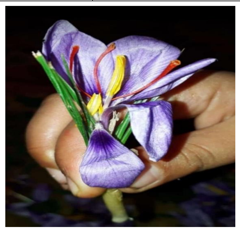
Figure 1. Saffron Flower