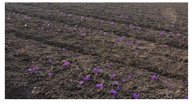
Figure 2. Saffron flowering in Fields of Pampore, Pulwama