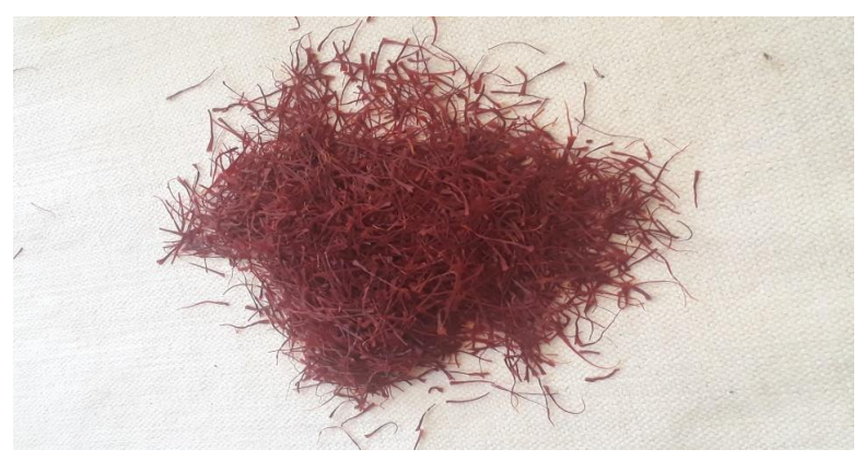
Figure 4. Kashmiri Saffron Ready for Use

After the plucking of flowers in very first year of cultivation, the saffron fields are being left untouched upto the advent of new spring (March/April). The fields are again being prepared for yielding of crop. This time only hoeing is done, i.e., operation of providing aeration to the soil, which is considered very useful for the development of corms. Followed by second hoeing in the mid of August, considered to be very much important for good yield of saffron. The last hoeing is done in September, about 30 to 35 days before the flowering of crop and the repairing of saffron beds and drainage channels is also finalized. These operations of hoeing are very much useful for the growth and health of corms and for the good yield of saffron as it provides the aeration to the soil and corms and through which the delicate stems of flowers emerge on the surface.