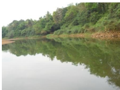
Fig. 7. Keezhvaipur