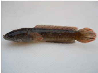
Fig.30. Channa gachua , fresh;