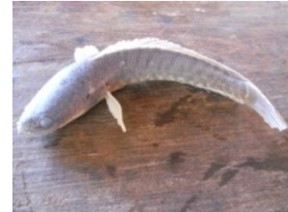
Fig. 29. C. striatus , preserved