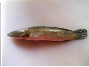
Fig.25. Young adult