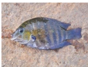
Fig.39. E. suratensis - dark green