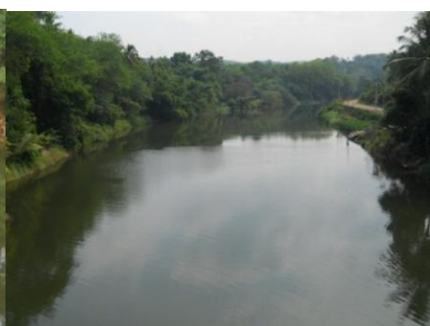
Fig. 8. Komalam