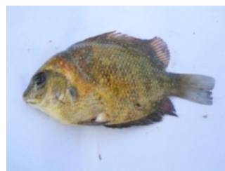
Fig.40. Yellowish green