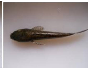
Fig.32. C. gachua , dorsal view