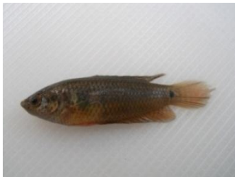
Fig.33. Pseudosphromenus cupanus , brownish;