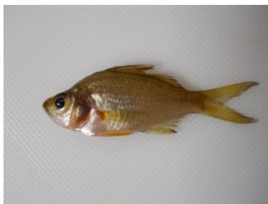
Fig.18. P. thomassi , golden;