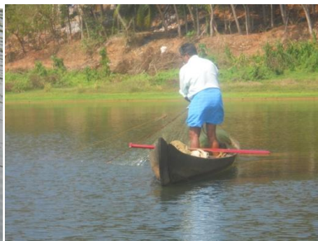
Fig. 11. Gill Fishing from a Vallom

Fish Collection and Preservation: Different types of nets are employed for fish collection. Dip nets, Gill nets (Fig. 10 & Fig. 11) and Caste nets were used for this purpose. Nine percent formalin was used as preservative.