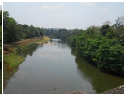
Fig. 6. Kavanalkadavu