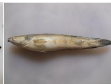
Fig. 22 C. marulius , whitish;