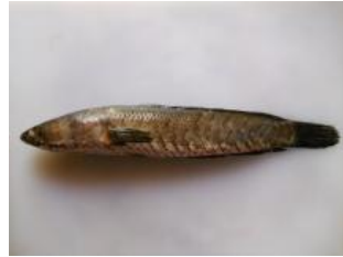
Fig. 28 C. striatus , adult