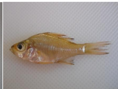
Fig.19. P. thomassi yellowish;