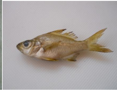
Fig. 14 A. commersoni , Yellowish