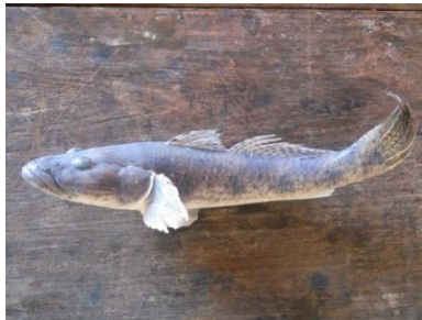
Fig.52. Glossogobius giuris giuris , Preserved