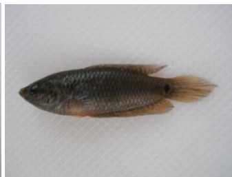
Fig. 34. Blackish;