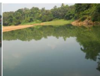
Fig. 3. Kottangal