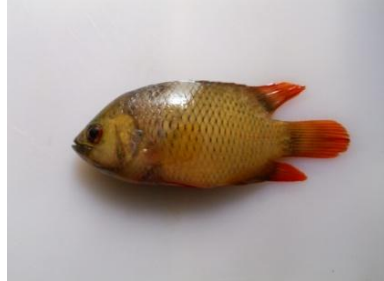
Fig.46. Pristolepis rubripinnis , Greenish;