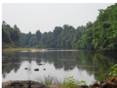
Fig. 4. Kulathoormuzhy