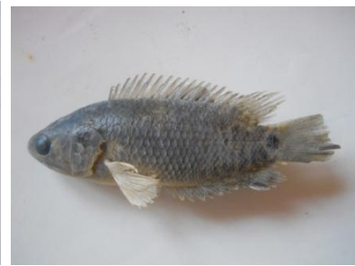
Fig.50. Anabas testudineus , Preserved