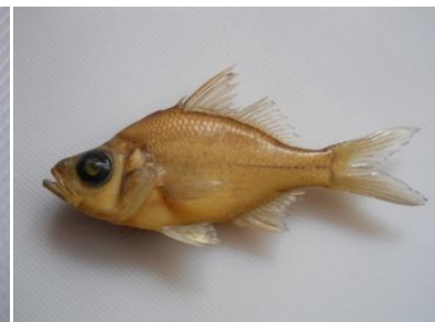
Fig.20. P. thomassi , preserved