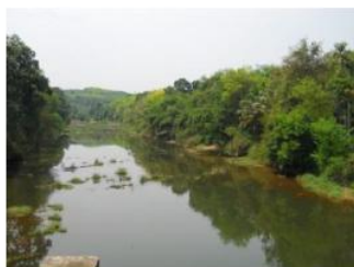
Fig. 1. Chenapady

Study Site: The Study was conducted during the period from January 2010 to December 2013. Chenapady, Manimala, Kottangal, Kulathurmoozhy, Thelapuzha, Kavanalkadavu, Keezhvaipur, Komalom and Karuthavadasserikara were the mid level sites of the Manimala River selected for the present study (Fig. 1- 9). Middle level regions of Manimala River basin consist of agricultural areas and deciduous forests. Riparian vegetation is moderately dense to thick. River bed is generally rocky in upper parts of middle level regions; but sand deposits can be seen within pools in this stretch. The bed materials are generally sandy gravel, gravelly sand and gravel in lower parts of middle level regions of the river. Pebbles and cobbles are present in sediments in appreciable amounts; but gravelly sediments are predominant. Some lower areas host a thick deposit of sand and gravel.