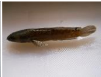
Fig. 31 C. gachua , preserved;