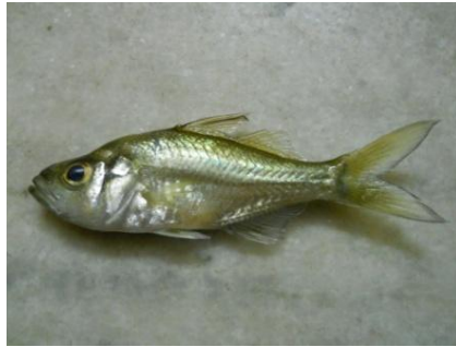
Fig. 13 Ambassis commersoni , greenish

Other features: Dark blotches present on flanks; two dorsal fins present; first dorsal inserted a little in front of the origin of pelvic, a little nearer to snout than caudal fin; tip of pelvic fin reach anal opening; tip of anal fin very nearer to root of caudal base; caudal fin obtuse.