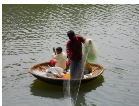
Fig. 10. Gill Fishing from a Kotta thoni