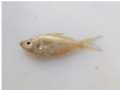
Fig.15. Parambassis dayi , silvery