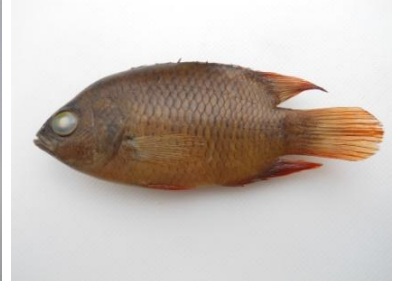
Fig.47. Pristolepis rubripinnis , Preserved