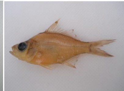
Fig.17 P. dayi , with deeper body