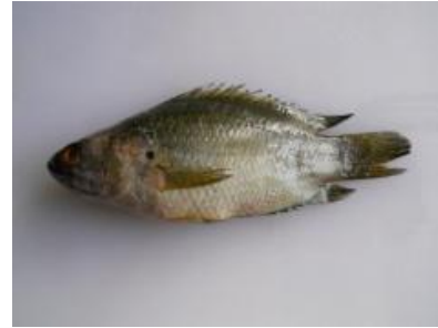
Fig.49 . Anabas testudineus , Greenish;