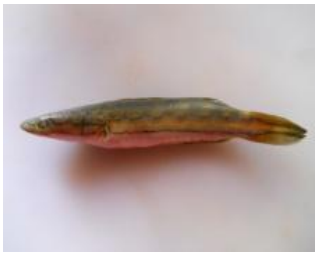
Fig.24. Channa micropeltes , young;