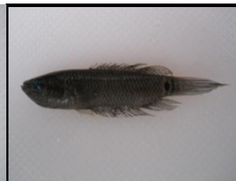
Fig. 35. Uncommon