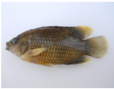
Fig.42. Pristolepis malabarica , fresh;