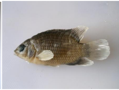
Fig.44. Pristolepis malabarica , Greyish