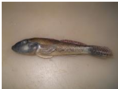
Fig.54. Awaous gutum - Brown