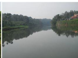
Fig. 2. Manimala