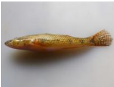
Fig.51. Glossogobius giuris giuris , yellowish