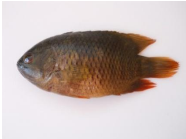
Fig.45 Pristolepis rubripinnis , reddish