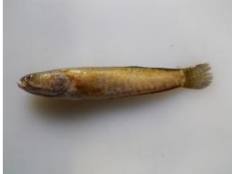
Fig. 2. Channa striatus , young