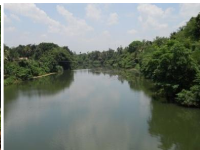
Fig. 5. Thelapuzha