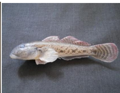
Fig.55. Awaous gutum , Reddish