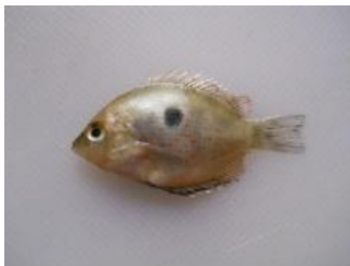
Fig.36. P. maculatus (Bloch), greenish