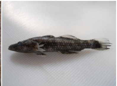
Fig.53. Glossogobius giuris giuris , Blackish