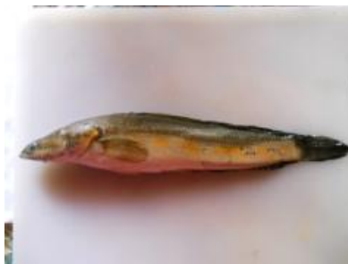
Fig.21. Channa marulius , yellowish;