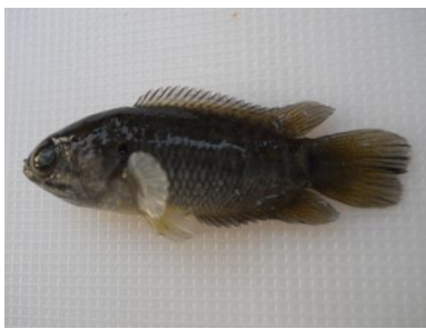
Fig. 48 Anabas testudineus , blackish