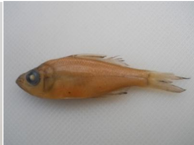
Fig.16. P. dayi , brownish