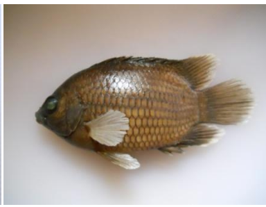
Fig.43. Pristolepis malabarica , Preserved;