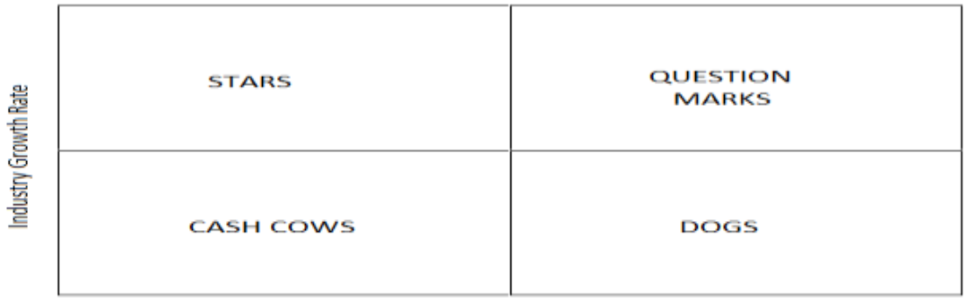
Relative Market Share

carry on this efficiently, the researchers' employed the BCG Matrix model (Kazmi, 2006) shown in Figure 2 above. Although there are other models that deal with positioning for profitable growth, the BCG matrix model will be used for this research. This is based on banks activities that are parallel or uniform to business units in numerous localities, countries, regions, and continents in which banks carry out their activities as separate entities, but all constitute to market portfolio.