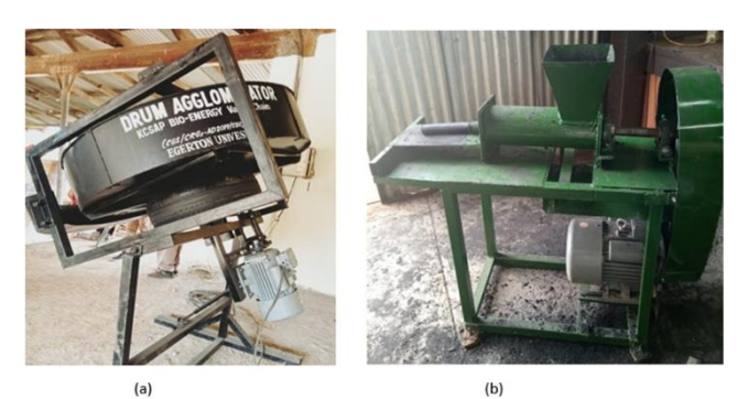
Figure 4. Briquetting Technologies (a) Drum Agglomerator (b) Screw Press

Economics of Briquettes and Charcoal Production Technologies in Kenya: Implication for Wide-scale Commercialization