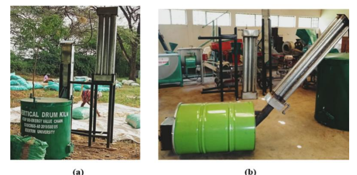
Figure3. Charcoaling Technologies (a) Vertical Drum Kiln (b) Horizontal Drum Kiln