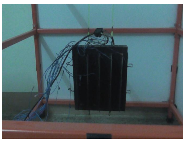
Figure 2. Plain Plate with Vertical Fins Blackened Surface