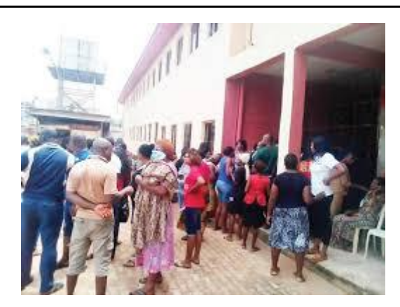
Parents waiting to pick their children from school due to the panic