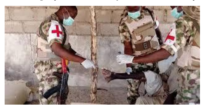
Army personnel giving the free medical service