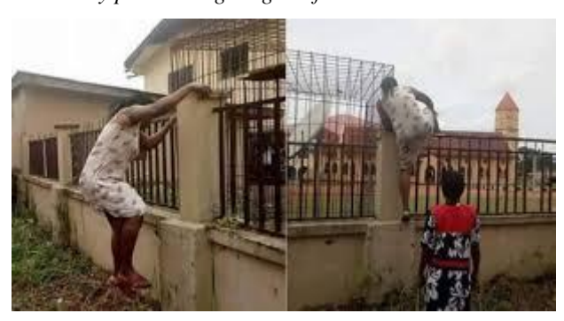
Some parents climbing fense to go and pick their children from school