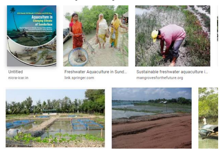
Fig. Sustainable aquaculture: Paddy cum fish culture, Duck cum fish culture

crucial occasions and non-selection of suggested rehearses. Absence of innovative information for logical fish cultivating, absence of institutional help what's more, specialized skill and social issues were accounted for as normal issues in aquaculture part of India.