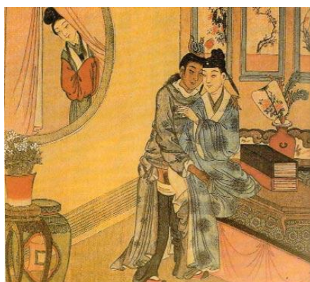
A woman spying on two male lovers 15

For China, the reality is that government and institutions are liberalizing the act. It is not accepted, but it's tolerated, once it doesn't go against national policy. When you have a population of over 50+ million gays (figures can go as high as 70+million, nobody is certain), you have to consider the future alternatives. 12 Therefore, I don't doubt that in a less than a decade the law will change in the People's Republic of China (P.R.C.) and Hong Kong, S.A.R. (Special Administrative Region) to allow homosexuals to marry and later think about adoption. This was something that would have made singer and gay icon, Leslie Cheung proud. 13 That finally gays are being accepted into the mainstream. They may suffer discrimination, but not hate crimes or the violence perpetrated in other countries. However, for a country which shies away from controversy; it has been said that 80% of homosexual men will marry out of social pressure and stay silent for the rest of their lives. 14