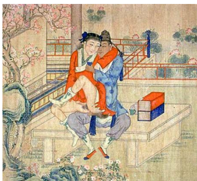
Two young Chinese men drinking tea and having sex. The "submissive" partner would be lighter in skin colour to reflect his femininity. 11

And it is know in East Asian societies the risk is to be ostracized permanently. However, even that is changing. Check what happened to Japan back in 2017, when through a surprising and landmark decision, the Japanese government finally allowed same-sex unions. Something which never happened before and still highly contested by this conservative society. But consider this for a moment, today you can marry in Japan with your homosexual partner. It has taken far longer in Japan to accept the crime of rape, than to accept homosexuals as human beings.