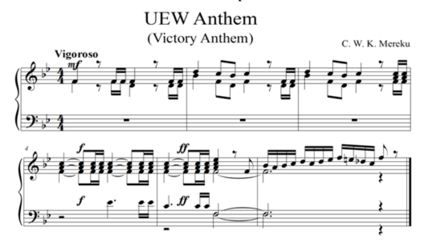
Figure 1. Introductory passage to UEW Anthem

Varied rehearsal techniques were used subsequently during the implementation process. The second day of meeting the band offered an opportunity for the researcher and the bandsmen to confirm the transcriptions done for the anthems by way of playing or practicing them as transcribed. The first anthem tackled, among the three, was the Victory anthem. This anthem is of the quasi-polyphonic texture and therefore required more time to accomplish its study. Ample time was given to the introductory fanfare passage and the various rehearsal sections as indicated by rehearsal letters by the composer in the score. The introduction is illustrated in piano reduction score below: