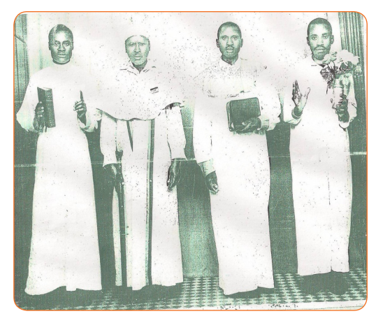
Photo 2.2: First ADC Bishop Saul Chabuga (second from left) and other church leaders

Biography of the ADC Archbishops Saul Chabuga: (1898- 1970)