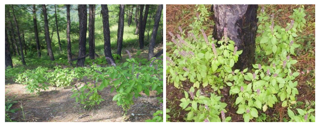
Fig3. Growth of Ocimum basilicum in Chir pine forests