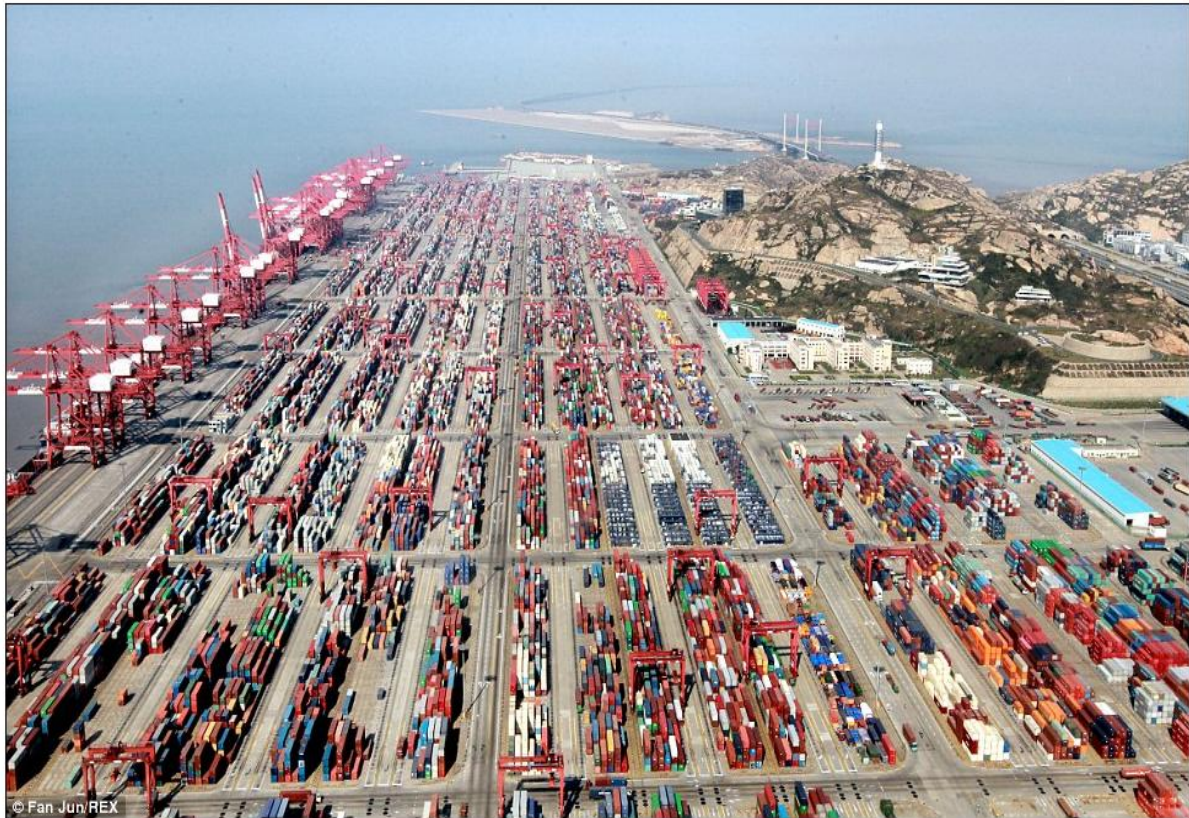
Fig2. The container pier at Yangshan Port, which forms part of the Port of Shanghai, which last year handled nearly 740million tonnes of goods

Port of Shanghai is the world's busiest trading port which handles a staggering 32million containers a year carrying 736million tonnes of goods to far-flung places around the globe.