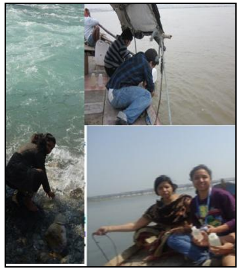
Figure 2. Collection of Samples

electrode by applying a voltage between a working and an auxiliary electrode. The registration of the current potential was related to the amount of analyte found in the electrode interface [11].