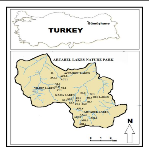
Figure 1. The Studied Area [7]

In the Artabel Lakes Nature Park, there are three stream basins, which are the Gümüştuğ Stream basin (Kara and Beş Lakes), the Artabel Stream basin (Artabel Lakes), and the Kongel Stream basin (Yıldız and Acembol Lakes). The total basin area is approximately 58.2 km<sup>2</sup> and is composed of 5 different lake sites including the Artabel Lakes (ARL), Acembol Lakes (ACL), Beş Lakes (BL), Kara Lakes (KL) and Yıldız Lakes (YL). In total, there are 23 lakes: the Artabel Lakes (6), Acembol Lakes (3), Beş Lakes (5), Kara Lakes (6) and Yıldız Lakes (3). Some of the different size of the lakes have been linked to othersor are independence of each other [7]. There is also a previously unnamed lake (Isimsiz Lake: IL) and a small pond (Yıldız Lakes Pond (YLP)).These lakes are glacial in origin, covered with iced layers for at least 8 months of the year and situated in the alpine zone (2687-3030 m a.s.l.).It is not possible to fully describe the diatom flora year-round because of difficulties surrounding the access to these areas.