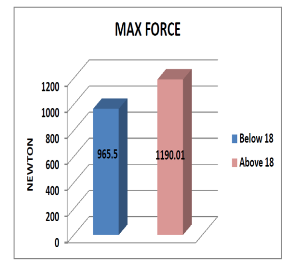
Graph1. Significant difference (0.002) observed in maximum force of squat jump in badminton players with BMI below and above 18.