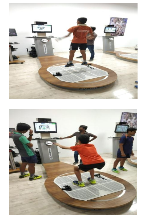
Figure2 and 3. BAI players using the Iso Lift system for assessment of Squat Jump