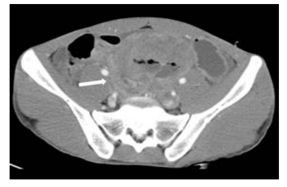
Figure1B. Additional upper level axial CT scan