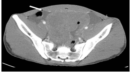
Figure1A. Contrast-enhanced CT scan with axial image (A) shows a large mass containing an internal irregular cavity with heterogeneous enhancement at the pelvic cavity and evidence of diffuse peritonitis with abnormal free air (arrow) suggesting diffuse panperitonitis.

amount of free air in the abdominal cavity suggestive of pneumoperitoneum, as well as a moderate amount of ascites in the abdominopelvic cavity with mild