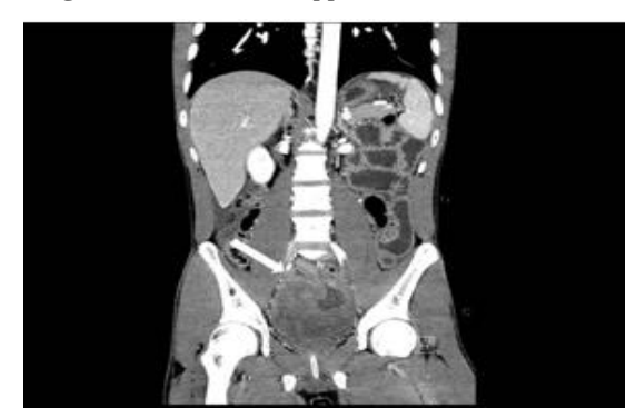
Figure1C. Coronal reformatted (C) images show the mass abutting a distal ileal loop (arrow)