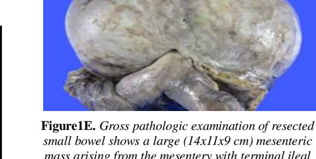
small bowel shows a large (14x11x9 cm) mesenteric mass arising from the mesentery with terminal ileal perforation (E)