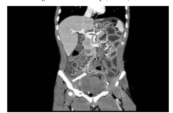
Figure1D. Engorged ileocolic vessels (D, arrow)