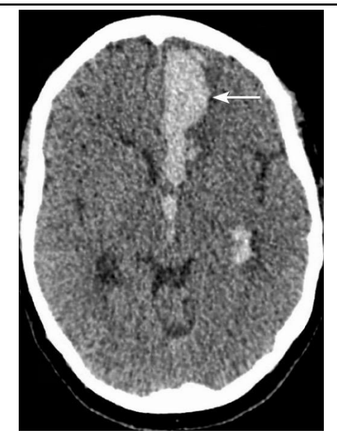
Figure1. CT brain shows subarachnoid along the interhemispheric fissure (white arrow) with extension into the third and left lateral ventricle.