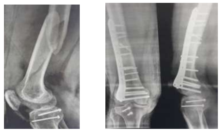
Figure4. Left: another trauma incident to one of our patients, Right: the same patient 13 months after fixation

The range of motion at the final visit showed complete range of motion in 28 patients (84.8%), the remaining five patients showed differences between 5^{\circ} and 10^{\circ} compared to normal side. This could be explained by concomitant ipsilateral injuries at time of trauma in four patients and another incident of trauma in one patient (fracture distal femur fixed by distal anatomical locked plate (Fig.4). No patients had arthrofibrosis or stiffness.