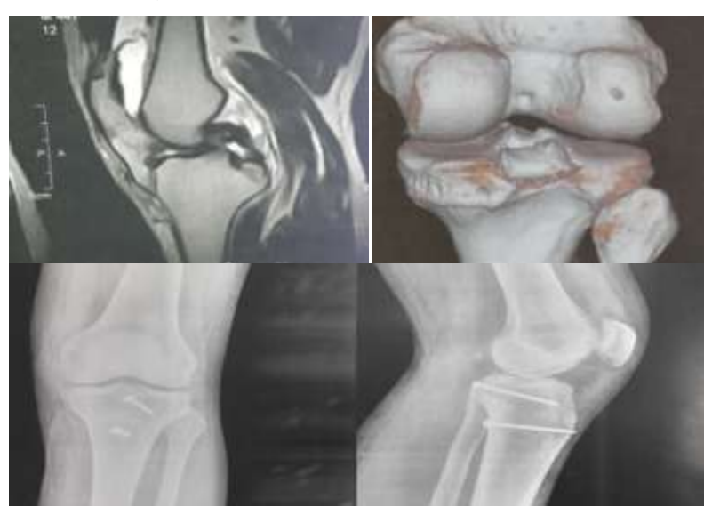
Figure3. Above: preoperative MRI (left) and 3D CT (right), Below: the same patient 16 months postoperative

Radiographs were obtained at first to detect union to allow weight bearing, then to follow the consolidation of the union and detect any secondary displacement. Functional Lysholm score [14] (grading limp, support instability, locking, pain, swelling, stair climbing and squatting) was adopted in this study and interpreted as poor (<65), Fair (65–83), good (84–90) and excellent (>90). Return to sports or labour work was delayed to 12 months after full rehabilitation and muscle strength compared to the other side. (Fig.3)