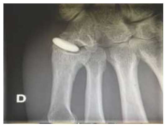
Figure2. AP, lateral, stress closed fist post-operative X ray for patient A at 23 months follow up

Preoperative radiographs showed HM osteoarthritis at M5 for 2 patients and hamatometacarpal osteoarthritis at M4 and M5 in 2 cases. Radiological analysis at the last follow-up, showed that the implant was in place compared to the full-face postoperative (Fig2) and profile (Fig3) postoperative radiographs in all patients. There was no hamatometacarpal osteoarthritis. The cliches in closed fist stress (Fig 4) did not find dislocation or subluxation of the implant.