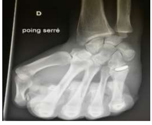
Figure3. AP, lateral, stress closed fist post-operative X ray for patient A at 23 months follow up