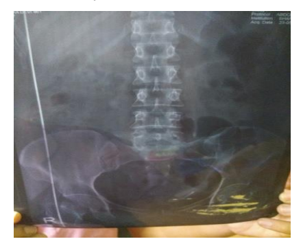
Fig2. IUD in the pelvic cavity