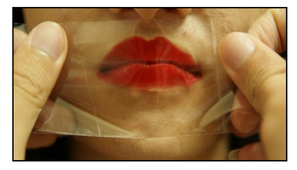
Figure2. Transparent cellophane tape pressed with adequate pressure on the subject's lips[5]

classified based on the Suzuki and Tsuchihashi classification, using a magnifying glass. The lip print was divided equally into six sections: upper left (UL), upper middle (UM), upper right (UR), lower right (LR), lower middle (LM) and lower left (LL).Data was analysed using Statistical Package Social Sciences (SPSS) to determine the differences in lip print patterns between sexes.