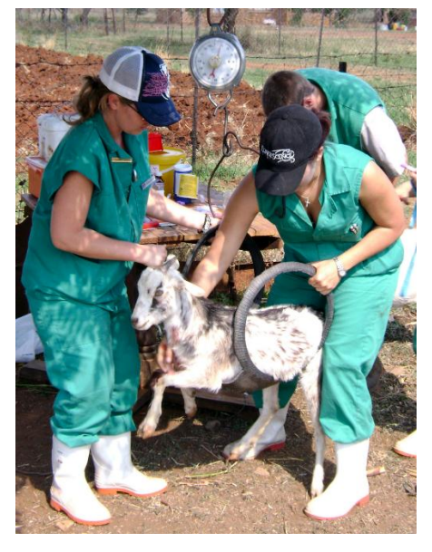
Figure 2. Weighing a goat using a simple device