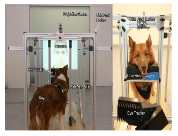
Figure1. The experimental set up. Left: view from the rear of the room with prospect on the chin rest and the projection screen. Right: front view on the chin rest with prospect on the eye tracker

As a heart rate monitor we used the Polar® RS800CX (Polar Electro GmBH, Ov. Finland). a telemetric and portable measuring system comprised of a wearable chest-belt which includes sensors and transmitters (WearLink and Sender W.I.N.D) that transmit heart beat recordings with a frequency of 1000Hz to the trainings computer. To guarantee optimal recordings, dogs' fur and skin and also the chest-belt were moisturized and lubricated with customary ultrasound-gel (Geilo GmBH, Ahaus. Germany). In order to correlate changes in the heart rate with the actual stimuli presentation, we videotaped the experiments with two additional cameras (JVC Everio G -GZ MG 750, Yokohama, Japan). One camera was in the front of the chin rest, filming the dogs' head. The second camera was placed behind the chin rest, filming the back of the dog and the projection screen and hence recording the onset of the stimulus presentation. Both cameras were synchronized every session for the exact time with the eye tracking computer and the Polar® monitor.