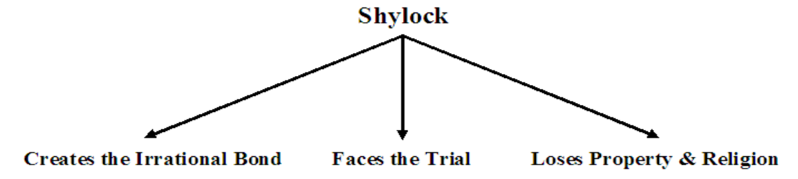
Fig 4. The Destruction of Shylock

The Duke does not put Shylock to death and it reveals his amazing demonstration of kindness. He even proposes that he will avoid claiming half of Shylock's assets and fine him only if Shylock behaves modestly. But, Shylock rejects the mercy suggested by the Duke. Consequently, they have their pound of flesh i.e. Shylock's heart. "Thus, not only does Shylock lose his 3000 ducats, his daughter, and his chance for revenge; he is also robbed of his income, his entire estate, and his religion (Antonio later stipulates that he must convert to Christianity), all in one fell swoop. By this feat of wit and merciless judgment, Portia permanently establishes Shylock as the scoundrel and herself as the hero" (Boulton, n.d., pp. 123-124). Shylock's procedural destruction can be exhibited through the illustration below: